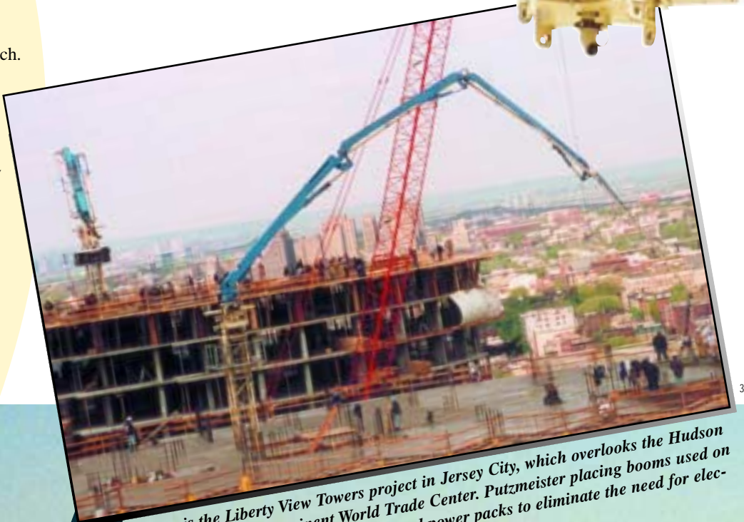
Above is the Liberty View Towers project in Jersey City, which overlooks the Hudson River at the once prominent World Trade Center. Putzmeister placing booms used on this job feature specially-designed diesel power packs to eliminate the need for electrical hook ups and save the contractor money.