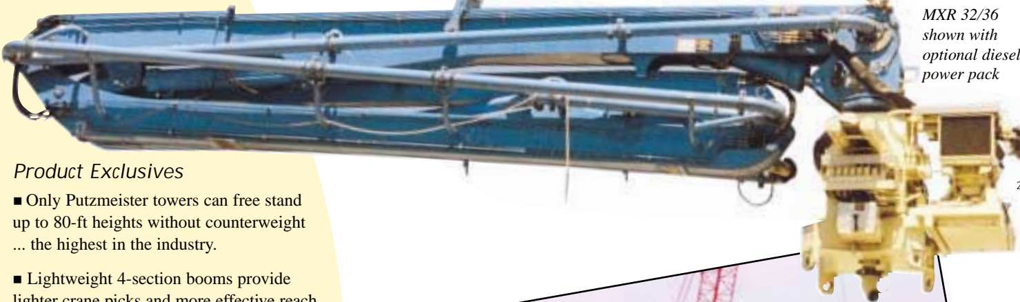
MXR 32/36 shown with optional diesel power pack